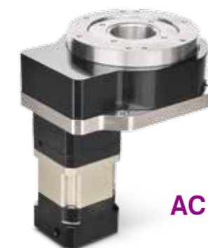
AC Servo Motor